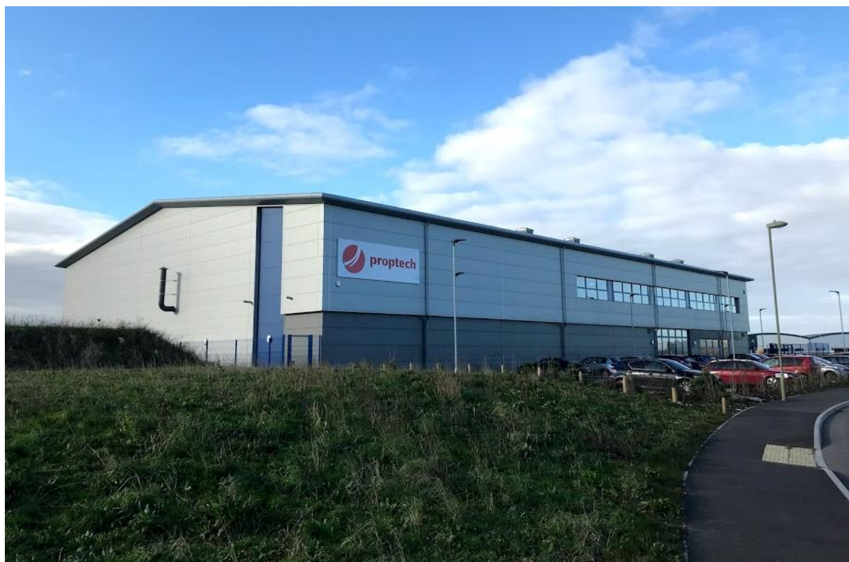
Employment floorspace completed at Daedalus Airfield, Hangars East (Swordfish Business Park)

8.5 There were no employment floorspace losses in 2016/17, either from demolition or to changes of use to alternative use classes. This represents a further improvement to floorspace losses since 2011/12. Furthermore, there were no conversions of offices to residential in the Borough in 2016/17 due to the changes made to General Permitted Development Rights in May 2013. Table 10 shows employment losses for the monitoring periods between 2011/12 to 2016/17.