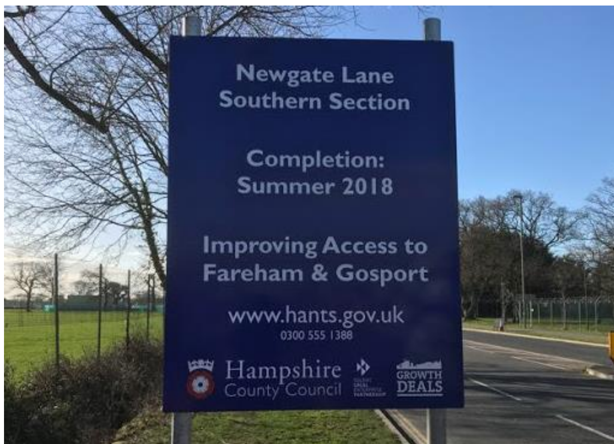
Newgate Lane Southern Section improvements