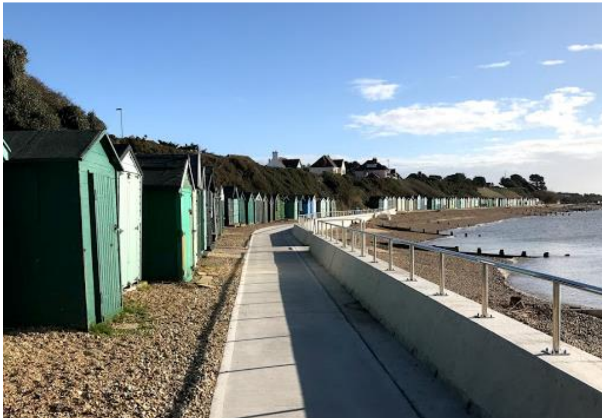
Hill Head sea wall replacement and promenade improvements