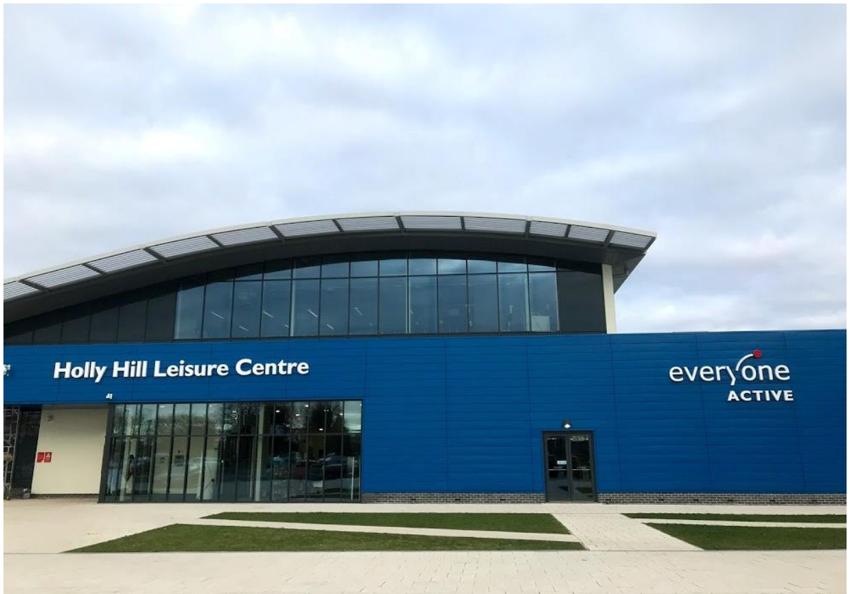
Holly Hill Leisure Centre, Western Wards