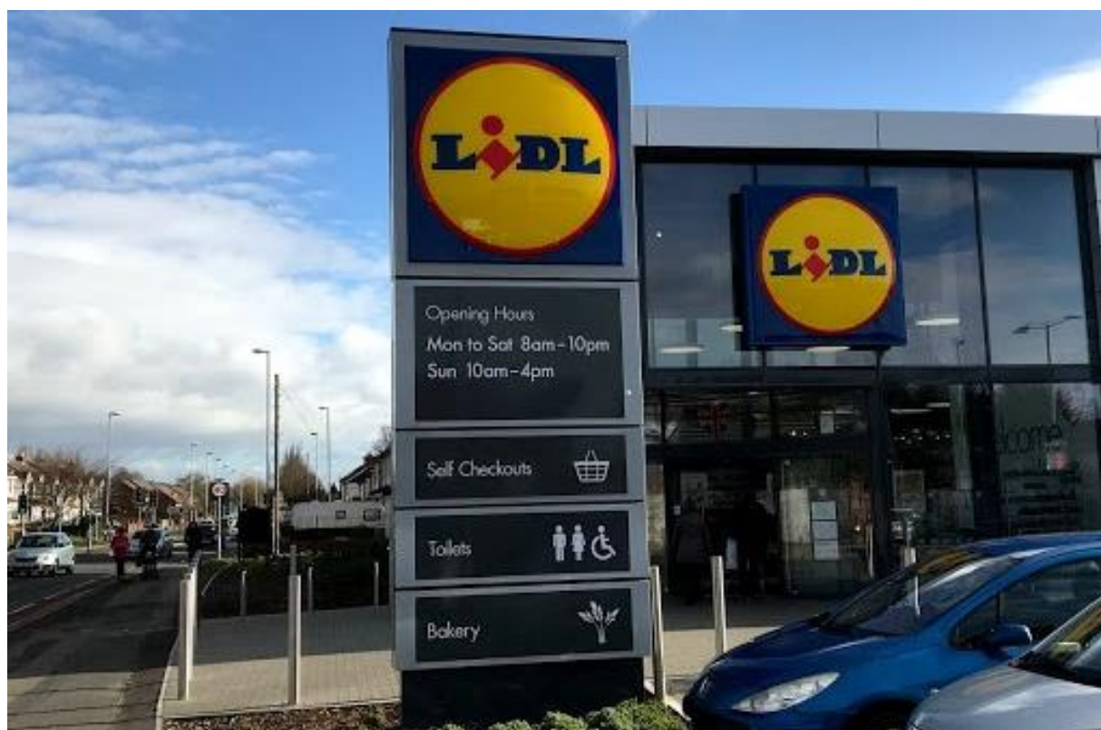
Lidl Food Store, Portchester