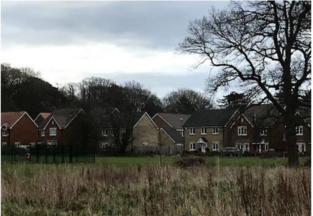
Completed housing at Coldeast, Western Wards